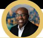
AG Kwame Raoul (D)

For people who are incarcerated in pre-trial detention that already have the right to vote, but are denied the right to vote through human error, will you protect their right?