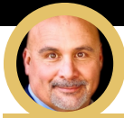
Jon Stewart (L)